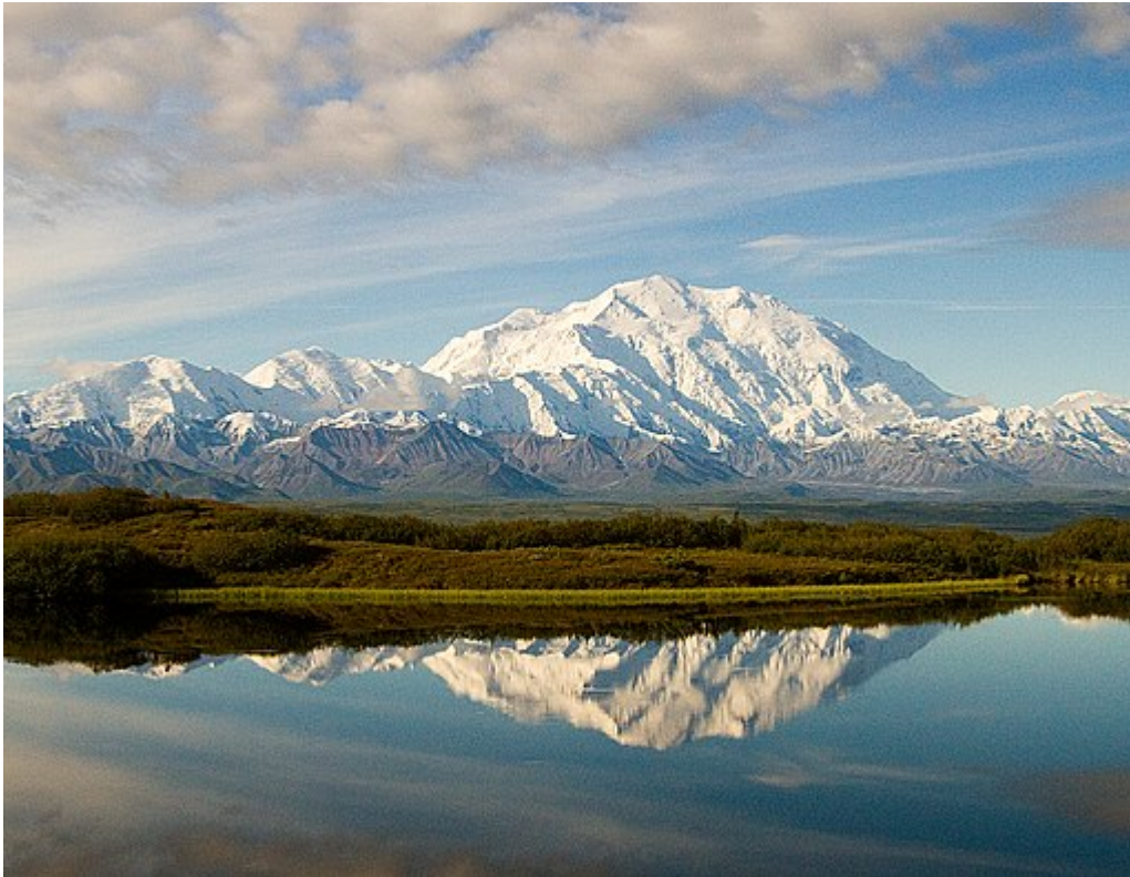
Denali National Park and Preserve

In 2015, President Barack Obama issued an executive order to change the name of Alaska's Mount McKinley (named for the nation's 25th President William McKinley) to Denali -- the mountain's name in the indigenous Athabasian language. Native tribes and political leaders in the state supported the change while officials in Ohio (President McKinley's home state) and then presidential candidate Donald Trump opposed it.