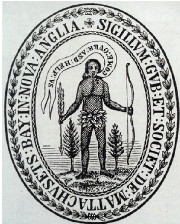
" Massachusetts Bay Colony seal granted by King Charles I in 1629 "

The seal featured an Indian holding an arrow pointed down in a gesture of peace, and the words "Come over and help us," emphasizing the missionary and commercial intentions of the original colonists