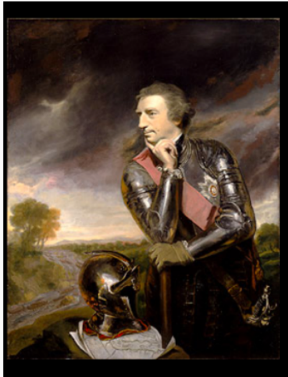
Portrait of Jeffrey Amherst "Amherst"

The complexities of place names and indigenous history is illustrated by the case of Jeffrey Amherst and the smallpox blankets. Jeffrey Amherst was a British army general during the French and Indian War and then royal governor of Virginia (although he refused to live there) in the decades before the American Revolution. The Town of Amherst, Massachusetts, founded in 1759, is named after him. Amherst College, founded in 1821, is named after the town. There are also towns named Amherst in Wisconsin, Virginia, Texas, Tennessee, South Dakota, Ohio, North Carolina, New York, New Hampshire, Nebraska, Montana, Minnesota, Maine, and Colorado.