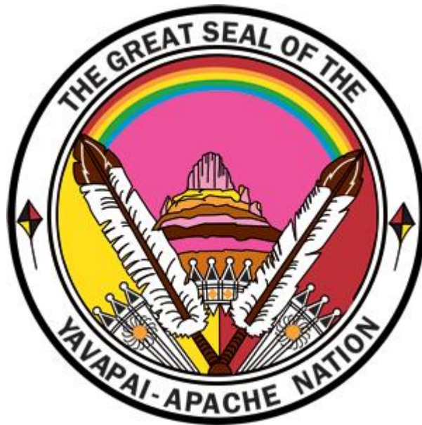
Yavapai-Apache logo by Yavapai-Apache Nation | Public Domain

from the smallpox infection to which natives had no immunity. Today, Native Americans number just over 2 million or 1% of the U. S. population. Nearly 4 out of 5 (78%) live off-reservations and 72% live in cities or suburbs ( The Guardian , September 4, 2017).