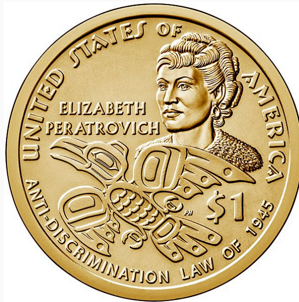
Reverse of the 1 US dollar coin - 2020 - series "Native Americans" by United States Mint picture Public Domain

Although November is National Native American Heritage Month , most students learn little about Native peoples or First American cultures in schools.