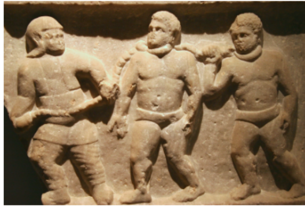
Photo of " Roman collared slaves - Ashmolean Museum "

Though slavery was widespread throughout the ancient world, ancient Rome was the society most reliant on slave labor with the highest number of slaves among its population. Estimates vary, but many sources estimate it was between one-fifth and one-third of the ancient Roman population was enslaved.