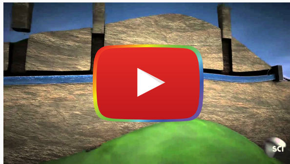
Watch on YouTube

The word "aqueduct" comes from the Latin words "aqua" meaning water and "ducere" meaning to lead or to conduit. Aqueducts transformed Roman society, one blog referred to them as the " dawn of plumbing ." To learn how aqueducts function, view the video: Roman Water Supply from Science Channel.