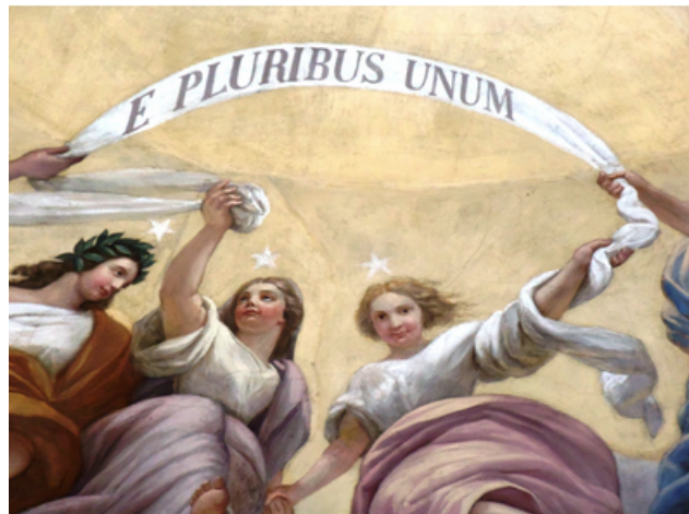
Latin Words in Everyday Language

E Pluribus Unum is a Latin phrase meaning from “ out of many, one. ” It was adopted as the United States' motto in 1782 and first appeared on a U.S. coin in 1795. It was intended to convey the message that the United States is one country made from many diverse peoples and places. E Pluribus Unum was replaced by “In God We Trust” as a Cold War-era statement against communism.