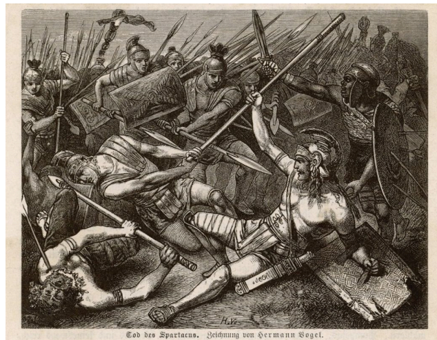
"Spartacus' death" by Hermann Vogel

Toussaint L'Ouverture , who has been called the Black Spartacus, was the leader of the Haitian Revolution, an uprising of African slaves on the island of Haiti that produced in 1804 the second independent republic in the western hemisphere (the United States was the first) (learn more from resourcesforhistoryteachers wiki page Toussaint L'Ouverture and the Haitian Revolution ).