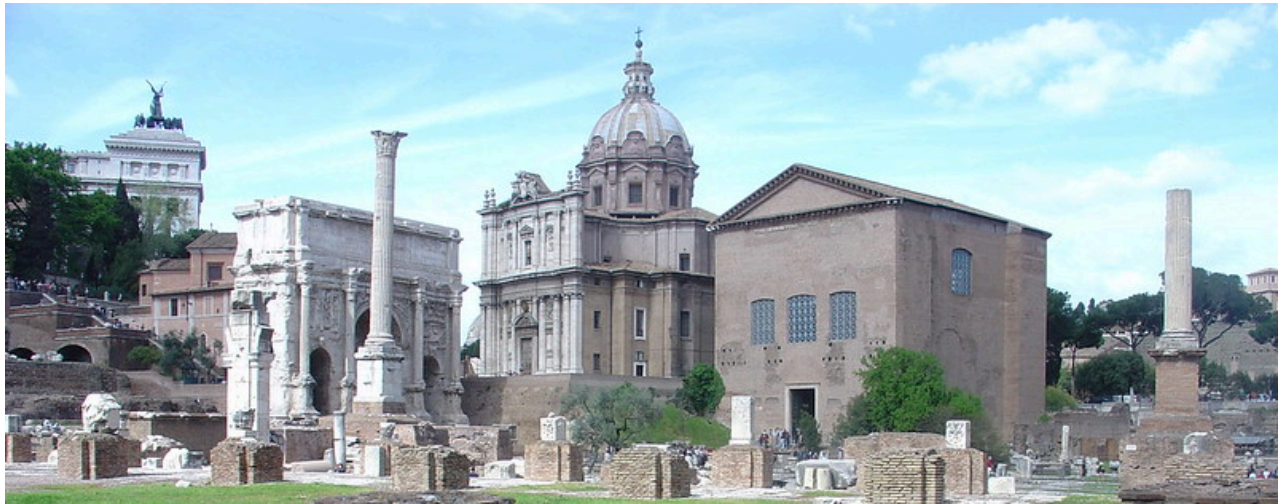
"Roman Forum, Rome, Italy"

attend or vote in political assemblies nor hold any political office. So, what did liberty, government, and democracy mean and for whom did they exist during the Roman Republic and later the Roman Empire?