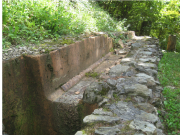
Aqueduc romain du Mont Chemin by Sylenius is licensed under CC BY-SA 4.0

In addition to its government institutions and social class system, ancient Rome is known for its architecture, engineering, and technology: roads, bridges, arches in buildings, domes, arenas and amphitheatres, baths, central heating, plumbing, and sanitation. These innovations were government-funded public works projects intended to further the power and control of the Republic and then the Roman Empire. Still, public works projects benefited people, a dynamic that is ever-present today where local, state, and federal government in the U.S. fund a wide range of services that people need and demand.