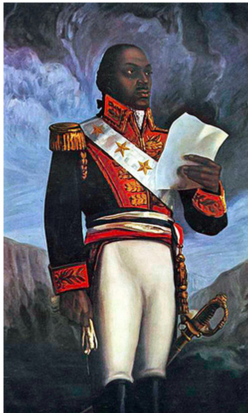
"Général Toussaint Louverture"

Toussaint L'Ouverture , who has been called the Black Spartacus, was the leader of the Haitian Revolution, an uprising of African slaves on the island of Haiti that produced in 1804 the second independent republic in the western hemisphere (the United States was the first) (learn more from resourcesforhistoryteachers wiki page Toussaint L'Ouverture and the Haitian Revolution ).