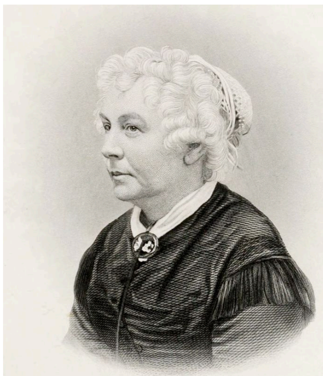
"Engraving of Elizabeth Cady Stanton" (created before 1869)

Modeled after the Declaration of Independence, the Declaration of Sentiments contained a list of the grievances and inequalities caused by men , which paralleled those caused by the King of England. It included a list of demands for equality for women in the home, at work, and in education, as well as a call for women's suffrage (the right to vote in political elections). Frederick Douglass attended and spoke at the convention, supporting suffrage. The resulting Declaration of Sentiments was signed by 100 people.