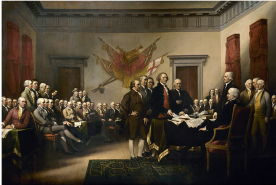
"Declaration of Independence" by John Trumbull

Drafted by Thomas Jefferson, edited by Benjamin Franklin and John Adams, and adopted by the Continental Congress on July 4, 1776, the Declaration of Independence consists of 1,320 of the most famous words and phrases in history: