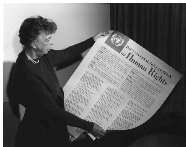
Eleanor Roosevelt holding poster of the Universal Declaration of Human Rights (in English), Lake Success, New York. November 1949.

Eleanor Roosevelt has been called the "First Lady of the World." One of her most important achievements was inspiring the writing of the Universal Declaration of Human Rights .