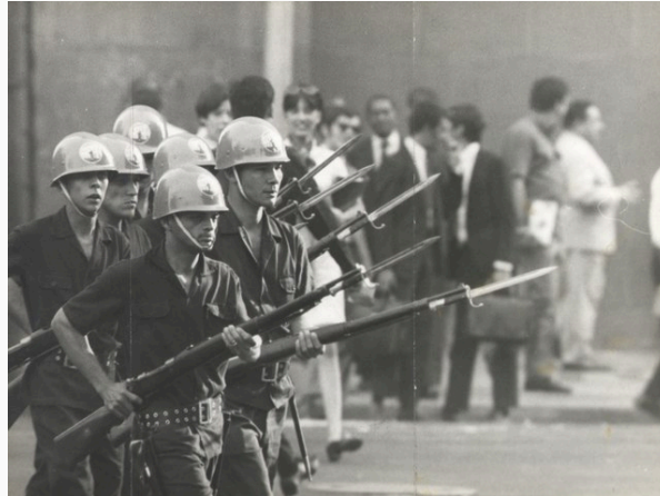
Student demonstration against the Military Dictatorship in Brazil |

Dictatorship and authoritarianism are the political opposites of democratically-based presidential and parliamentary systems of the government. The 20th century and the beginning of the 21st century have seen dictators and tyrants come to power across the globe.