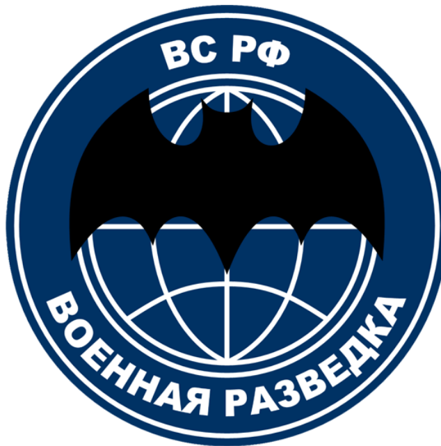
Emblem of the GRU, the Military Intelligence Service of the Russian Military

In recent years, Presidential war powers have been expanded by the AUMF (Authorization for Use of Military Force Against Terrorists) , passed just after the September 11, 2001 attacks on the World Trade Center and the Pentagon. An AUMF allows the President to utilize “all necessary and appropriate force . . . to prevent future acts of international terrorism against the United States” ( What the AUMF Is and Why You Should Care , Bipartisan Policy Center, April 18, 2018). Although the AUMF was initially intended to be used against al Qaeda and the Taliban, it has been used dozens of times in 14 countries, including the Trump Administration’s use of a missile strike to kill an Iranian general in Iraq on January 2, 2020.