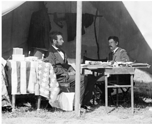
President Abraham Lincoln and General George B. McClellan in the general's tent