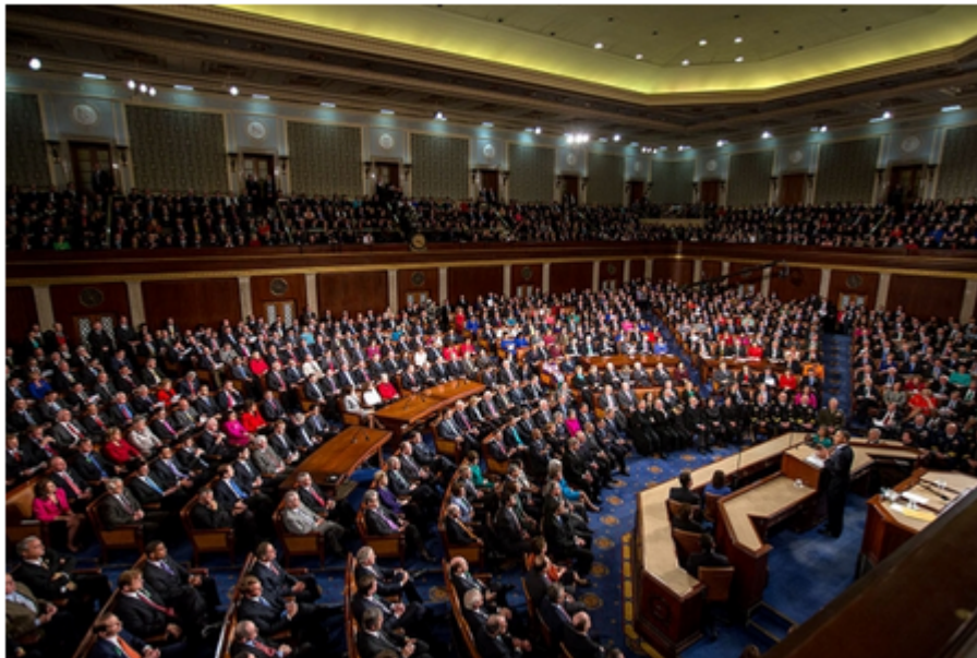
President Barack Obama delivers his State of the Union address, Feb. 12, 2013

Taken collectively, the powers given to the President by the Constitution combined with the ways a person in that office can energize public opinion to support policies give a President enormous influences over national and state government and the country as a whole.