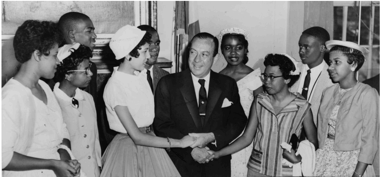
New York City Mayor Robert Wagner greeting the Little Rock Nine, the teenagers who integrated Central High School, Little Rock, Arkansas

The Little Rock Nine were a group of African American students who enrolled in Little Rock Arkansas Central High School in 1957. The state's White segregationist governor deployed National Guard soldiers to block the students from attending classes until President Dwight Eisenhower, yielding to pleas from Martin Luther King, Jr. and other civil right leaders, sent in troops from the Army's 101st Airborne Division to ensure that the students could go to school.