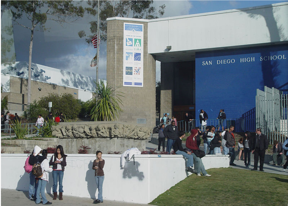
San Diego High School is the Oldest Public School in California Still on its Original Site

Every one of the nation's 130,930 public schools has a name. While many are named for the town or street where they are located (e.g., Boston Latin School; Pleasant Street School) or a nearby geographic feature (e.g., Monument Mountain School), thousands are named for historically important individuals.