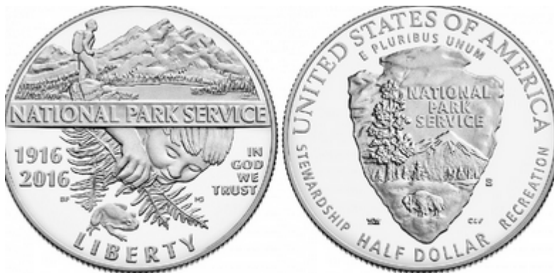
2016 National Park Service Proof Half Dollar