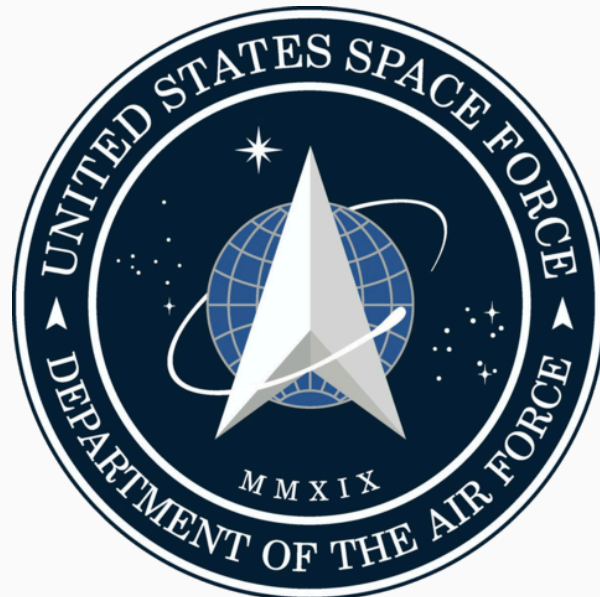
Seal of the United States Space Force | Public Domain

But, establishing a draft (mandatory enrollment in the armed forces) is an implied power that was used at different times in U.S. history from the Civil War to 1973. The U.S. military has been an all-volunteer force since that time with now more than 1.3 million active troops in six armed services: Army, Navy, Air Force, Marine Corps, Coast Guard, and Space Force.