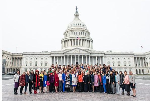
Women of the 116th Congress

Does language use by the media impact people's attitudes and behaviors? What difference do you think it makes if news reporters say "policemen" or "law enforcement officers" or "Congressmen" or "Members of Congress" or if they describe women and men in politics differently?