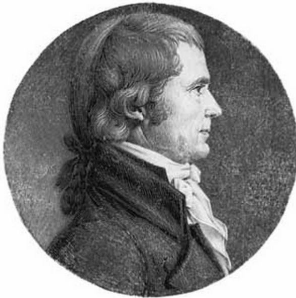
John Marshall Engraving , by Charles-Balthazar-Julien Fevret de Saint-Mémin, 1808, Public Domain

Under his leadership, the ‘ Marshall Court ’ shaped the law and government of the United States by testing and defining the powers of the newly adopted U.S. Constitution. He established the principle of Judicial Review whereby the Court has the final say in deciding whether congressional legislation is constitutional.