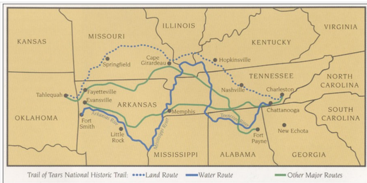
Trail of Tears Map, National Park Service (2005)