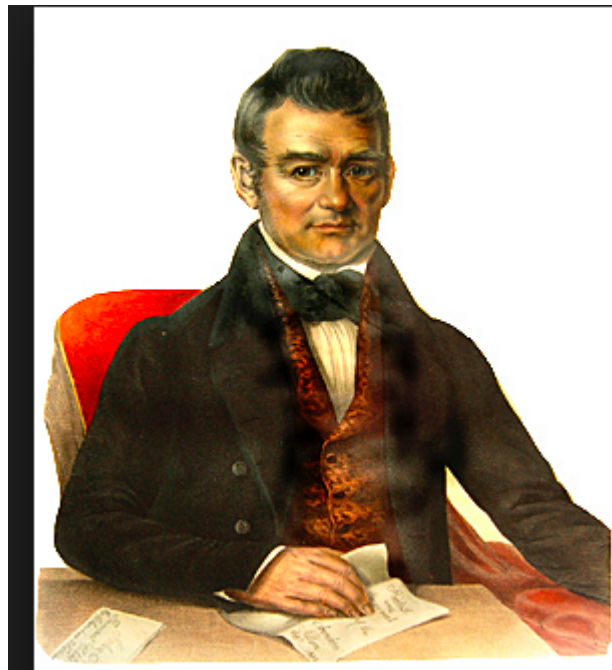
Chief John Ross, 1843 by Charles Bird King, Public Domain

The Cherokee people protested the policy, notably John Ross . He envisioned nationhood, not displacement and subjugation for his people ( Chief John Ross Protests the Treaty of New Echota ).