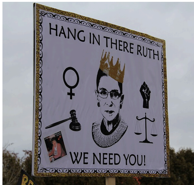
Sign Message for Supreme Court Justice Ruth Bader Ginsburg at a 2018 Women's March in Missoula, Montana

"I Dissent" is a powerful statement of politics and law. Dissents establish a counter-narrative to the majority opinion that can, over time, lead the Court and public opinion in new directions. As Ruth Bader Ginsburg stated: