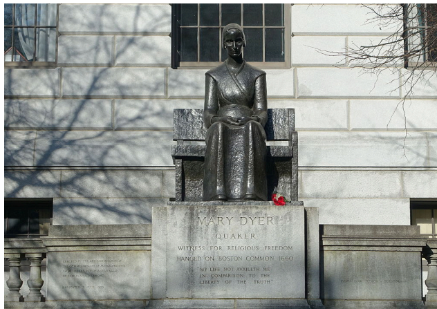
Mary Dyer Statue Outside the Massachusetts State House, Boston, Massachusetts

In 1638, following a trial as a heretic, she was banished to Rhode Island on charges of blasphemy and sedition. She later moved to the colony of New Netherlands (now New York) and was killed during an Indian raid. Learn more from the National Women's History Museum's Biography of Anne Hutchinson .