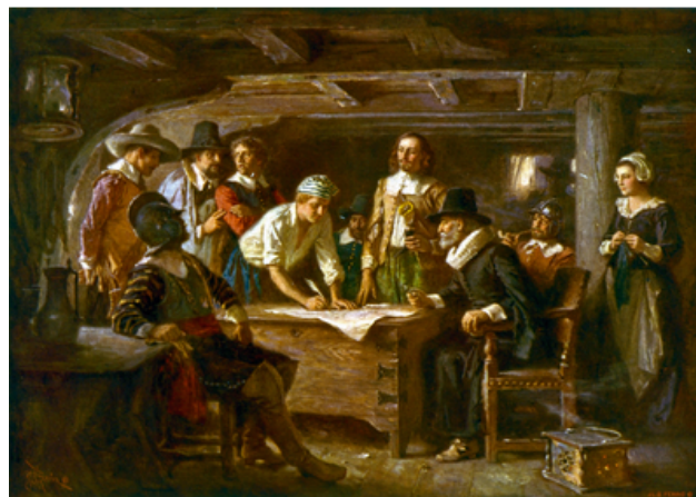
Signing of the Mayflower Compact, 1620

Signed in 1620 by 41 adult male passengers during the 3000-mile sea voyage from Holland to establish a colony in the new world of North America, the Mayflower Compact established a framework for self-government among the colonists.