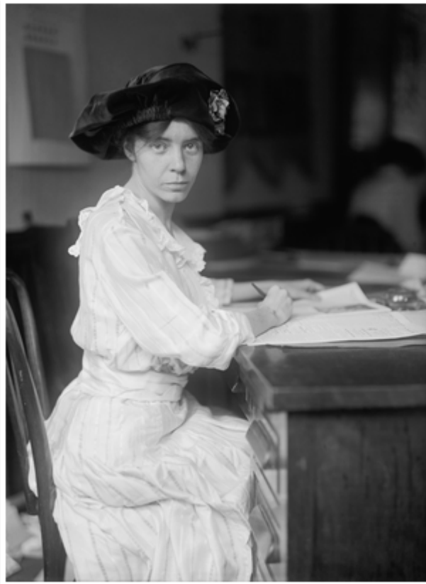
Alice Paul in 1915