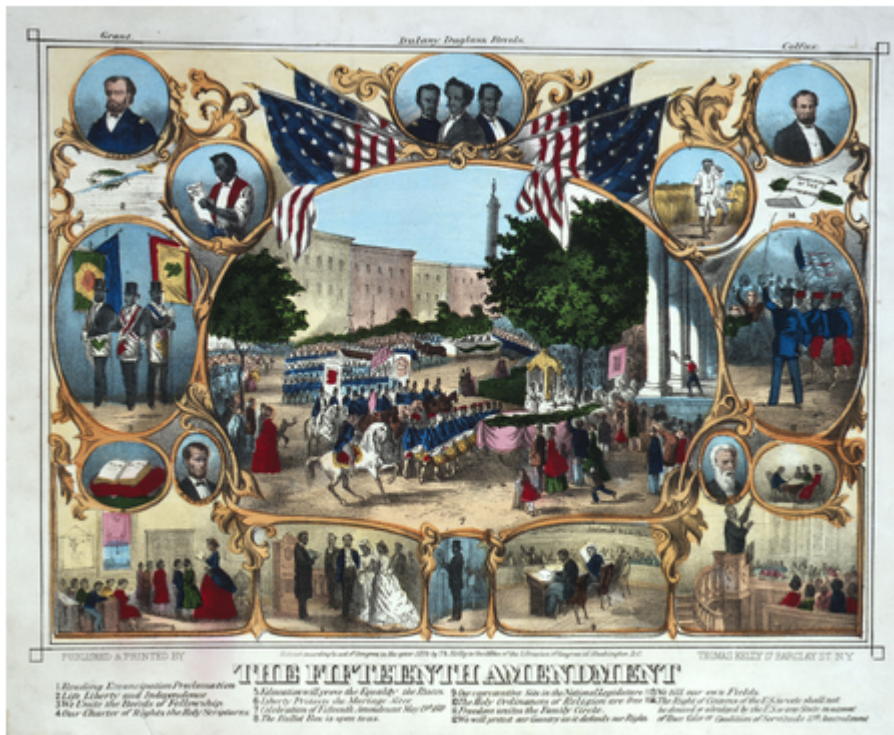
1870 Print Celebrating Passage of the 15th Amendment , Public Domain

(Massachusetts Curriculum Framework for History and Social Studies) [8.T5.2]