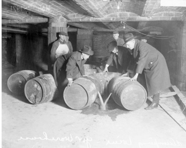
Prohibition agents destroying barrels of alcohol, 1921 , Public Domain

In 1919, the United States passed the 18th Amendment , prohibiting the manufacture, sale, and transportation of alcohol. It began a period in American history known as Prohibition .