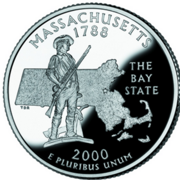
Massachusetts Quarter, 2000 . United States Mint, Public Domain)

Describe the provisions of the United States Constitution and the Massachusetts Constitution that define and distribute powers and authority of the federal and state government. (Massachusetts Curriculum Framework for History and Social Studies) [8.T6.2]