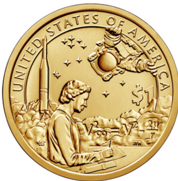
2019 Native American Dollar , United States Mint, Public Domain.

Under the United States Constitution, certain powers are reserved for the federal government while others belong to state governments alone, while still other powers are shared by both. For example, the federal government has the power to mint (make) money. No other government (state or local) or private individual has the power to make its own money.