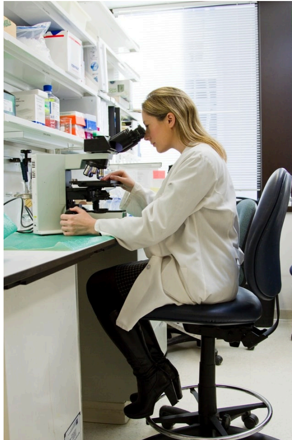
Now you should do grown-up research.

Now that you're an adult, we want to take your research and analysis skills to the next level. The tragic flaw of typical research papers is that they actually don't teach you how to do good research. Instead, they teach you how to make an argument and justify your argument with quotes you find to support that argument. You don't actually have to know what's going on, what the state of the field is—you just have to find sources that match what you're trying to say. But that's not how real-world research works.