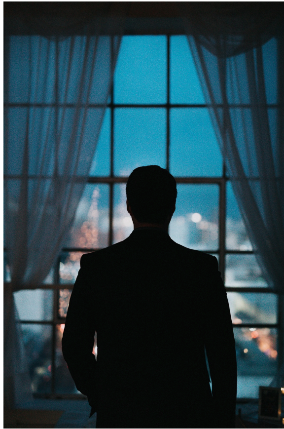
Learning about your field is a lot like being a spy.

Good spies gather intel before going out in public. They listen to the conversation stream, observe, practice. Then once they're out in the field, they fake it 'till they make it. As they go, they learn the tricks and language that bring them to be accepted into a group. In fact, spying and writing are so similar that some of the world's best writers were spies and some of the best spies became writers (see Ernest Hemingway, John Le Carre, Ian Fleming, and W. Somerset Maugham, for example).