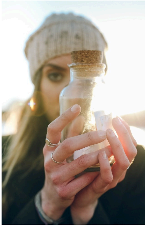
A message in a bottle: probably not the best format for a letter of recommendation.

Many of these agreed-upon shortcuts have now turned into their own Genres or expected ways of formatting a document. For example, if you ask your professor to recommend you to a graduate program, you expect them to write a formal letter of recommendation rather than, say, a text message or a message in a bottle. And, in fact, the formality and rigid organization of the letter of recommendation themselves signal to the audience that this is an official statement, that it should be taken much more seriously than a text message (or bottle message), and that the author has put significant thought and time into the document. The choice of genre alone is a sign to the audience of the document's context and purpose.